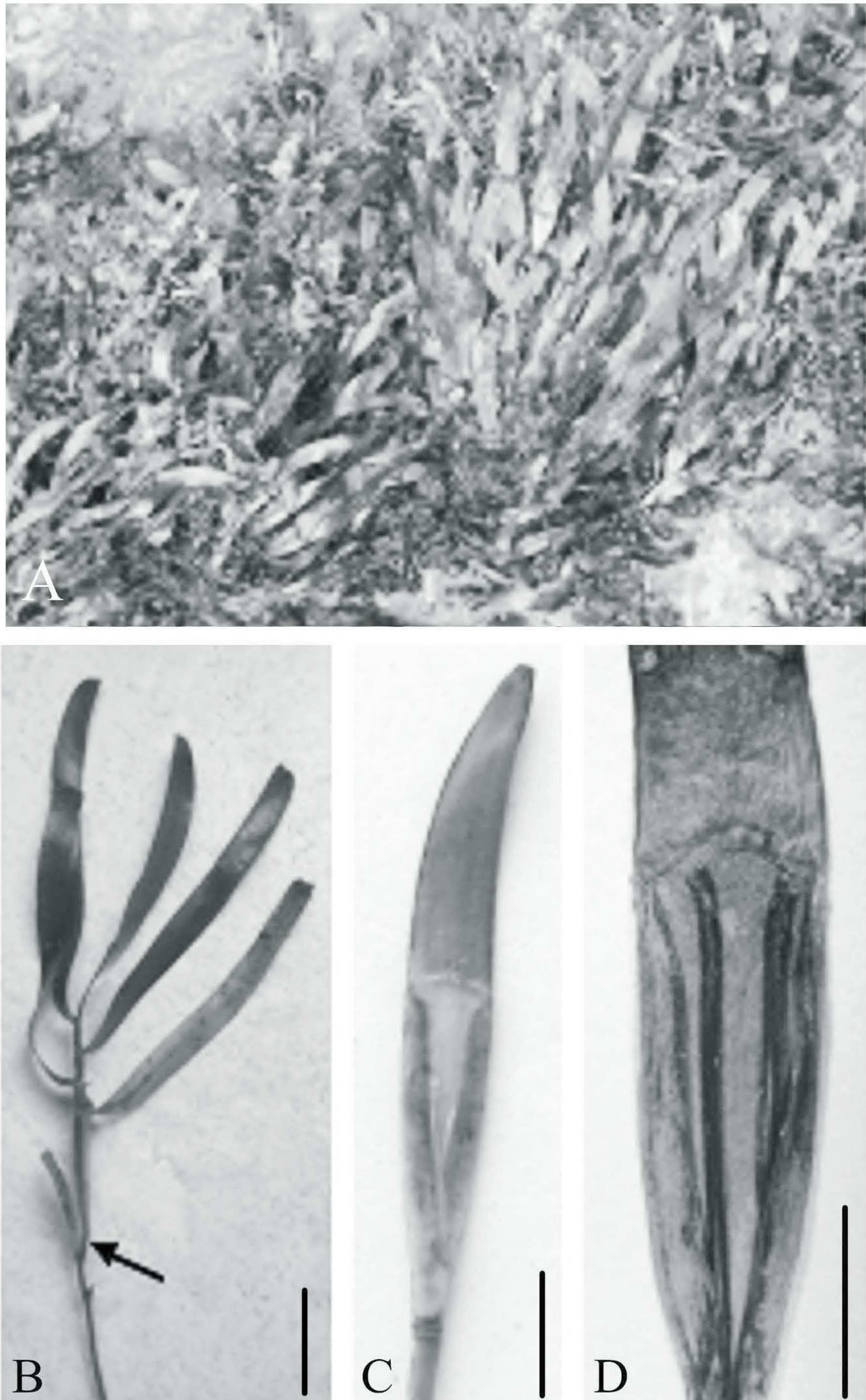
Figure 1. Thalassodendron leptocaulle Maria C. Duarte, Bandeira & Romeiras. —A. Community of T. leptocaulle and seaweeds in rocky pools, Inhaca Island, Ponta Mazónduè, Mozambique. —B. Flowering shoot with viviparous seedling (arrow). —C. Inner bract enclosing the female flower in fresh specimen. —D. Inner bract enclosing the female flower ( M. C. Duarte & A. M. Manjate 3801 , LISC). Scale bars: B = 15 mm; C, D = 5 mm.